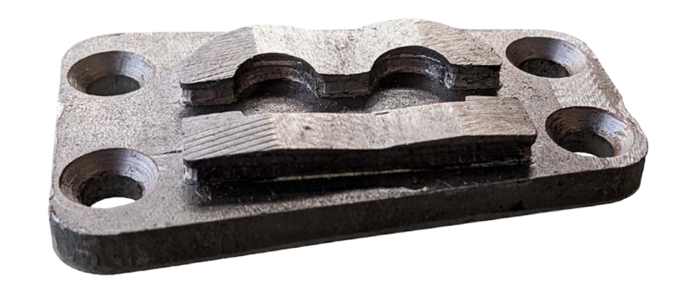
Punch of the letter B for a 1.75 inch Diagraph Jumbo.

Two types of replacement parts of dies and punches for the letters of a Diagraph Jumbo stencil cutting machine.