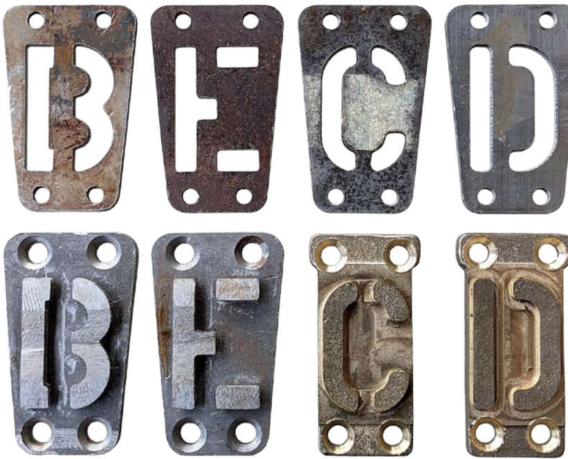
Diagraph Jumbo 1.75 inch Dies